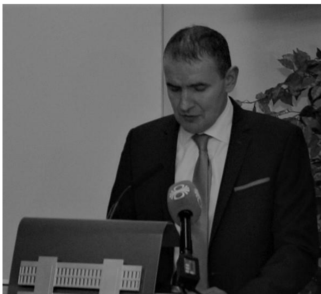
Guðni Th. Jóhannesson president of Iceland starts the lecture series Tímanna safn and the 200 th year's anniversary.

„Documentation makes a nation. The National Library and formation of memories in two centuries.”