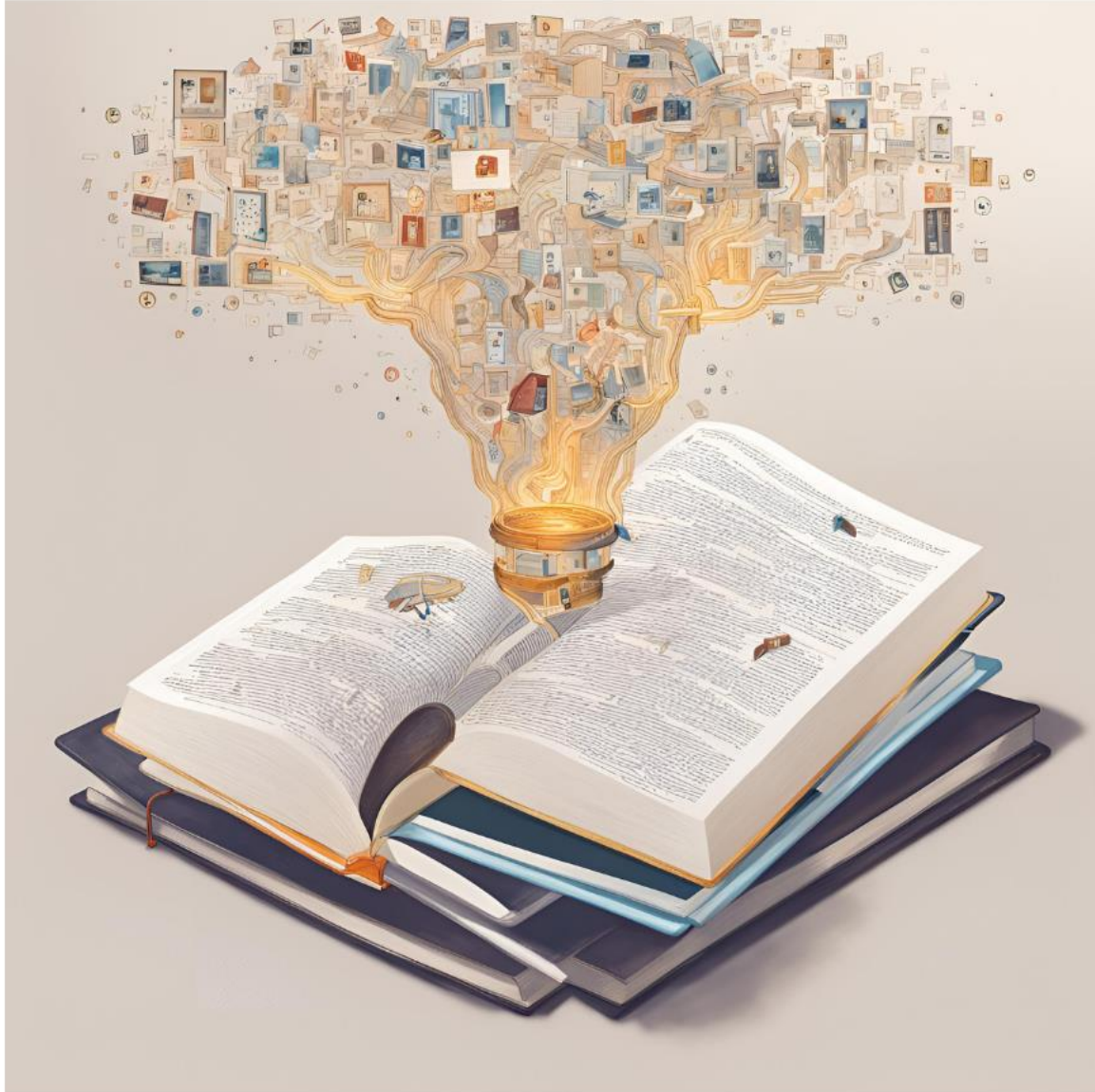
AI generated: Canva AI