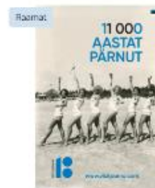
Kiireimad lennuühendused Tallinnast : LOT : suvi 27.III- 1.X Pämu Linnavalitsus 2038

Lorem ipsum dolor sit amet, consectetur adipiscing elit, sed do eiusmod tempor incididunt ut labore et dolore magna aliqua. Ut enim ad minim veniam, quis nostrud exercitation ullamco laboris.