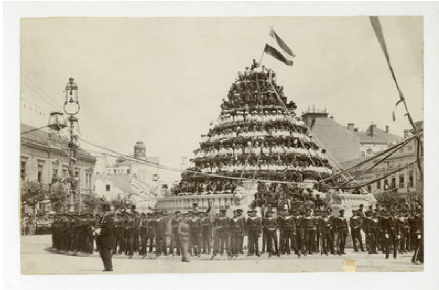
Sokols' bouquet to the Queen, 1922.