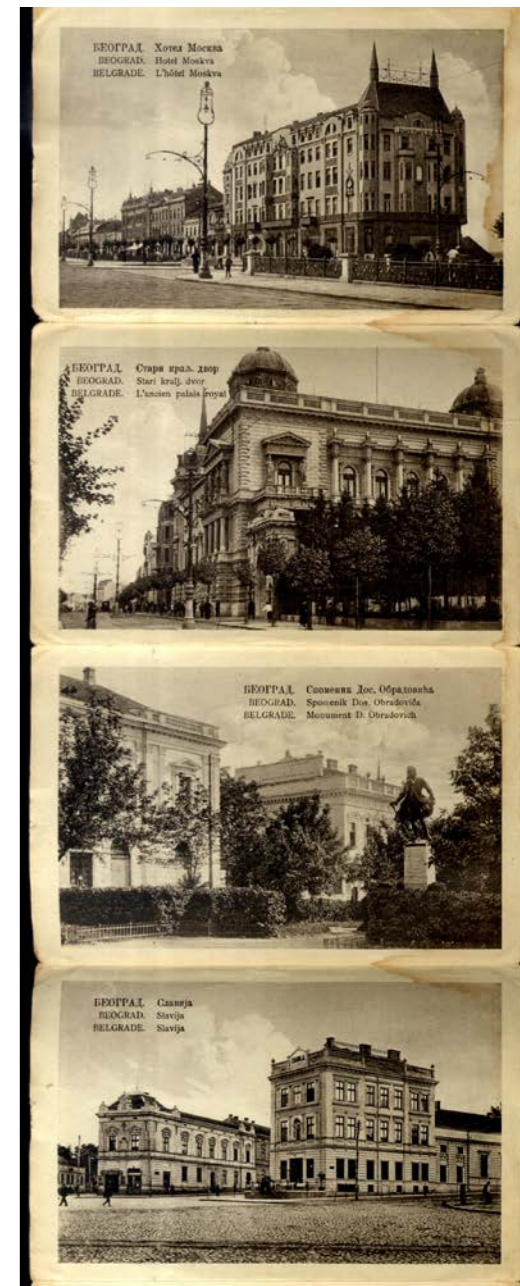
Belgrade, 1921 Digital NLS PDM